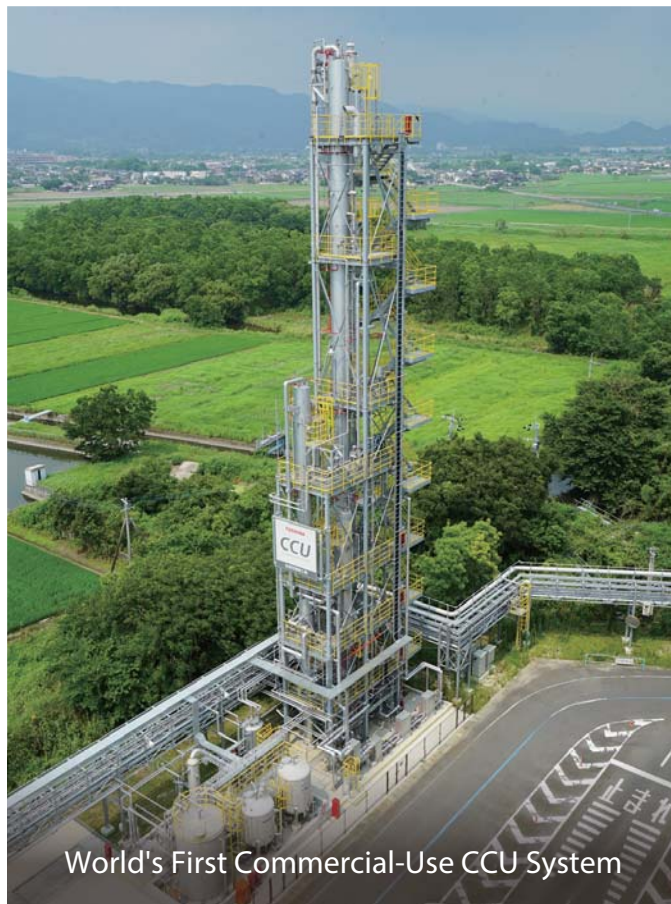
World's First Commercial-Use CCU System

Another approach Toshiba is investigating is Carbon Capture and Utilization (CCU), which effectively utilizes collected CO 2 to useable products and fuels. Again in Japan, a CO 2 separation and capture system delivered to Saga City, a local government, and installed at a waste incinerator is capturing high purity CO 2 that is used for commercial algae cultivation at a nearby plant factory.